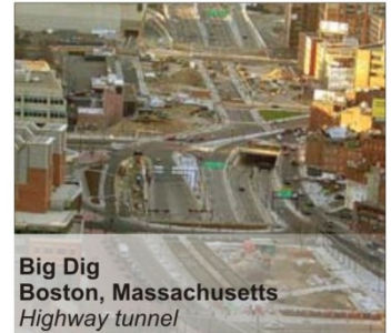
Big Dig Boston, Massachusetts Highway tunnel