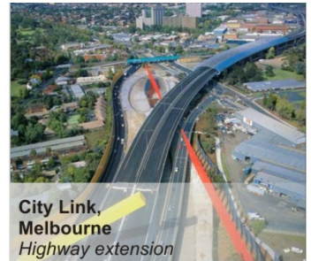
City Link, Melbourne Highway extension