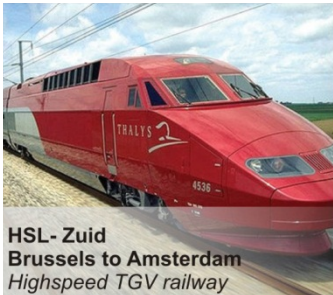
HSL- Zuid Brussels to Amsterdam Highspeed TGV railway

A global Centre of Excellence in Future Urban Transport sponsored by Volvo Research and Educational Foundations (VREF)