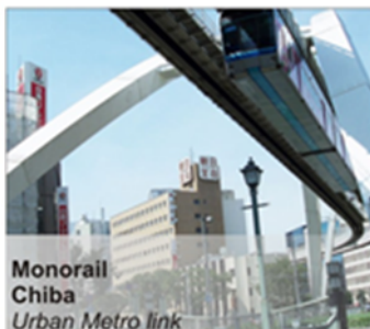
Monorail Chiba Urban Metro link