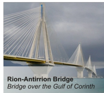
Rion-Antirion Bridge Bridge over the Gulf of Corinth