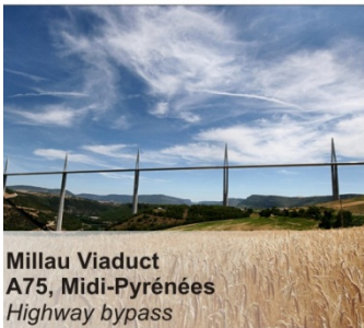
Millau Viaduct A75, Midi-Pyrénées Highway bypass