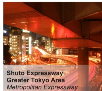
Shuto Expressway Greater Tokyo Area Metropolitan Expressway