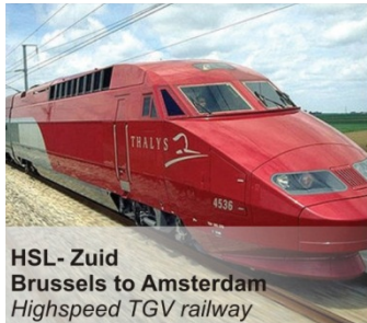
HSL- Zuid Brussels to Amsterdam Highspeed TGV railway

A global Centre of Excellence in Future Urban Transport sponsored by Volvo Research and Educational Foundations (VREF)