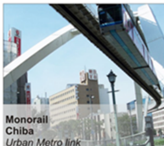
Monorail Chiba Urban Metro link