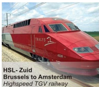
HSL- Zuid Brussels to Amsterdam Highspeed TGV railway

A global Centre of Excellence in Future Urban Transport sponsored by Volvo Research and Educational Foundations (VREF)