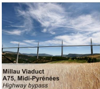
Millau Viaduct A75, Midi-Pyrénées Highway bypass