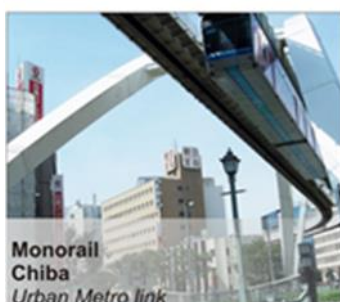
Monorail Chiba Urban Metro link