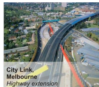
City Link, Melbourne Highway extension