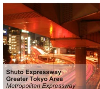
Shuto Expressway Greater Tokyo Area Metropolitan Expressway