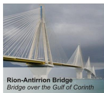
Rion-Antirion Bridge Bridge over the Gulf of Corinth