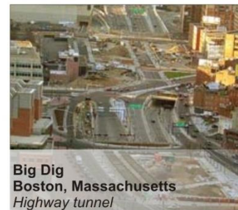
Big Dig Boston, Massachusetts Highway tunnel