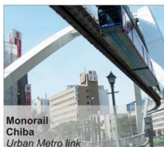
Monorail Chiba Urban Metro link