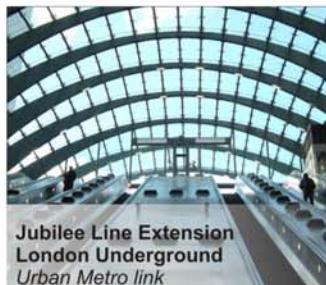
Jubilee Line Extension London Underground Urban Metro link