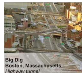
Big Dig Boston, Massachusetts Highway tunnel