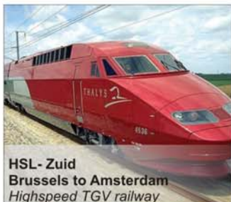
HSL- Zuid Brussels to Amsterdam Highspeed TGV railway

A global Centre of Excellence in Future Urban Transport sponsored by Volvo Research and Educational Foundations (VREF)