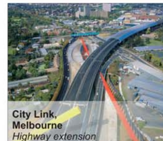
City Link, Melbourne Highway extension