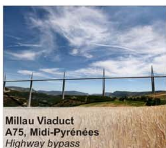
Millau Viaduct A75, Midi-Pyrénées Highway bypass