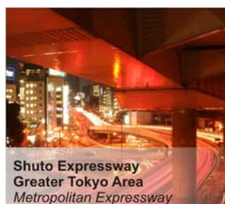
Shuto Expressway Greater Tokyo Area Metropolitan Expressway