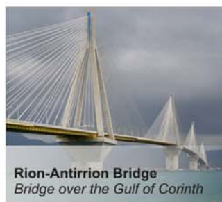
Rion-Antirrhion Bridge Bridge over the Gulf of Corinth